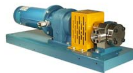
Zenith gear pump

Depending upon specific process requirements, almost any type of variable speed pump design may be incorporated into an Arbo integrated feeding system. Pumps with some degree of positive displacement discharge, such as the Zenith gear pump or the Lewa variable stroke diaphragm pump illustrated on the right are frequently selected. Application requirements such as fluid viscosity and/or operating pressure often determine the pump.