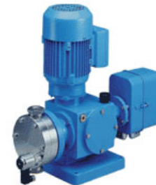
Lewa diaphragm pump